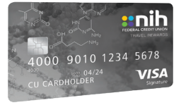
Signature Travel Rewards