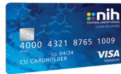
Signature Cash Rewards